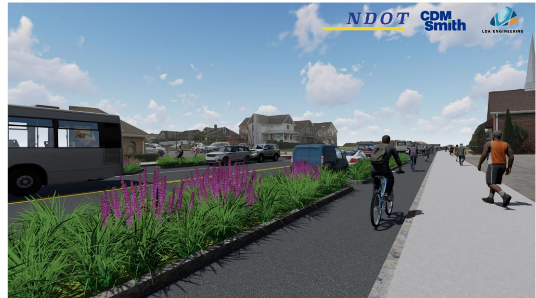
View of 12th Ave S complete and green street project at Caldwell Avenue, looking south