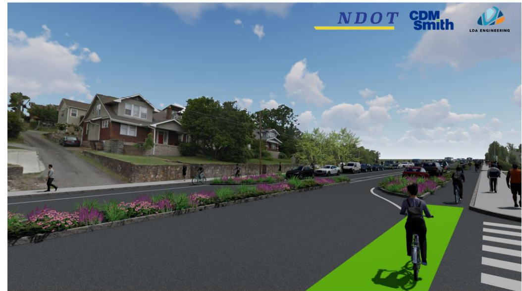
View of 12th Ave S complete and green street project at Lawrence Avenue, looking north