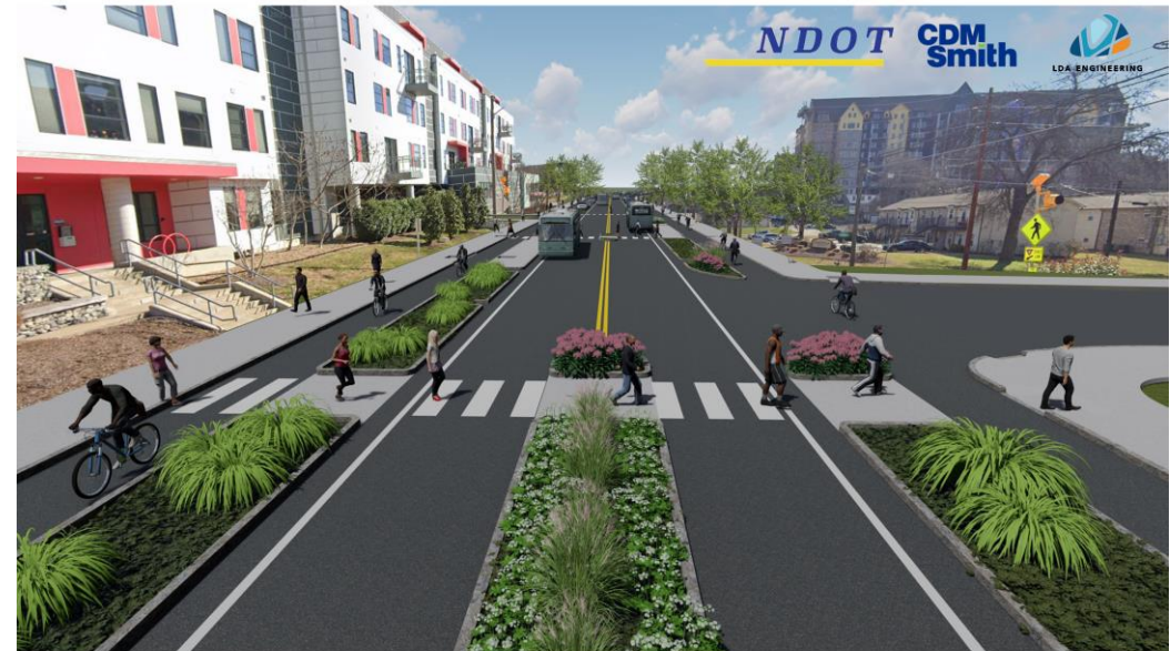
View of 12th Ave S complete and green street project at Acklen Avenue, looking south from above street level