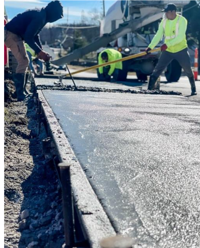
Metro contractor Roy T. Goodwin at work on a different project in town